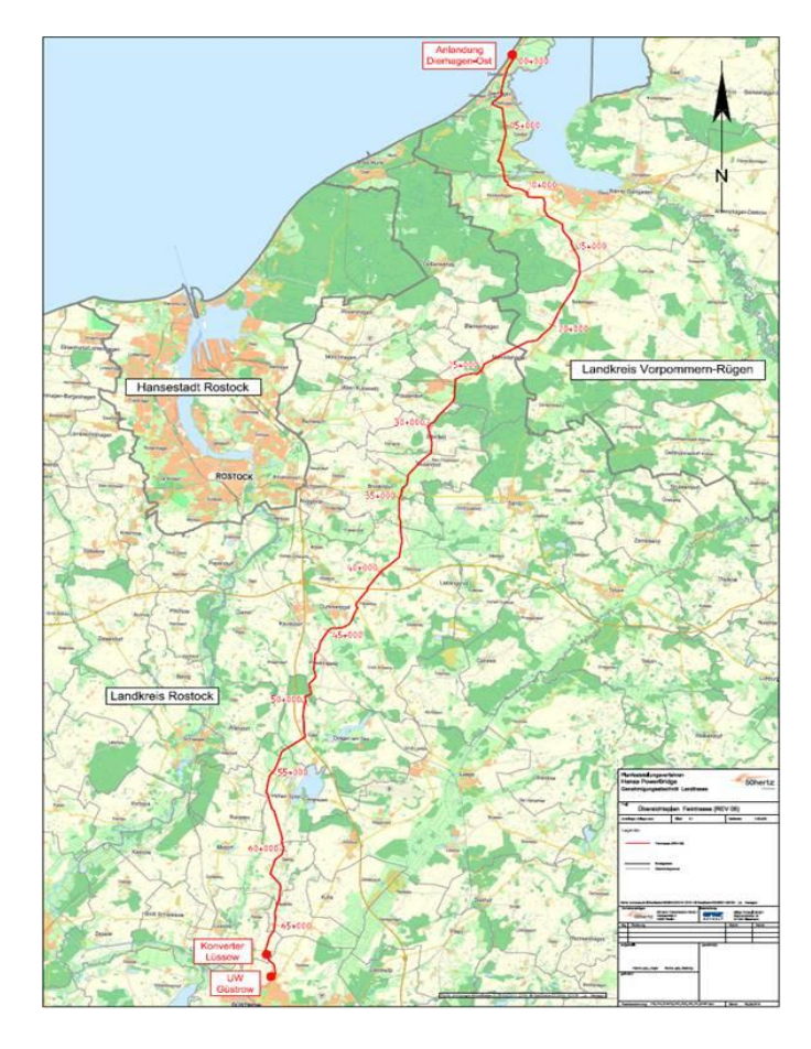
Full system (left), Germany Underground cable route (right)